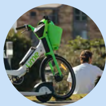
Why We Signed